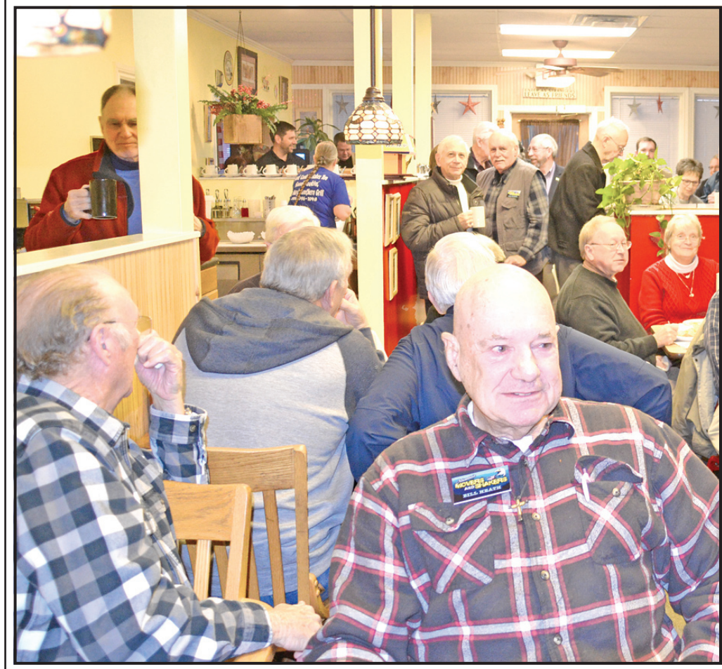
The meeting boasted one of the larger turnouts for the Movers and Shakers, at least in recent memory.